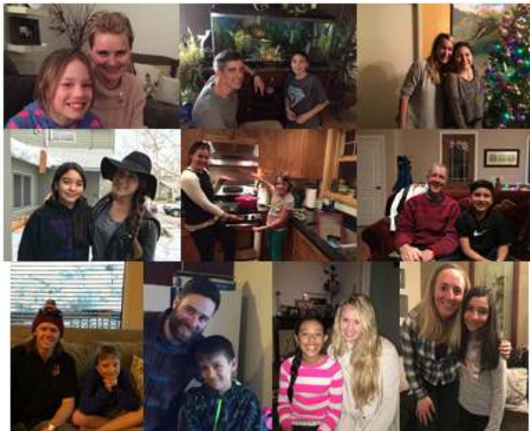
Community Pairs Pictured from left to right: